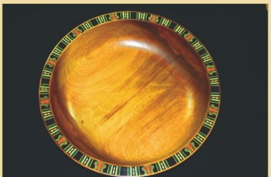
"Untitled 2" by Geoffrey Noden, is constructed of walnut, holly, red palm and cherry.