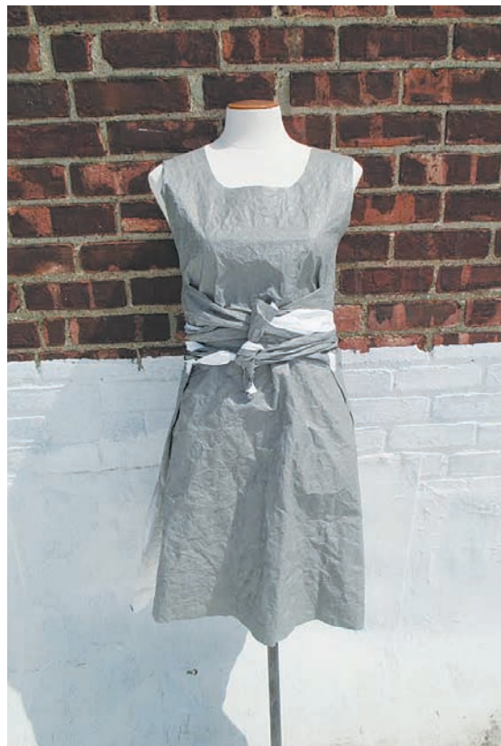
Marian Schoettle, MAU reversible wrap dress.

Invitational exhibition of contemporary textiles, showcasing the wide variety of methods and media worked by artists and articulated in fashion, accessories, jewelry, home decor, weaving, and design. Original pieces by 23 designers are on display. Professional couture and wearables, as well as wall art and sculptural installations express the latitude of the contemporary fiber arts. The pret-a-porter boutique and fitting room for fashionistas is featured.