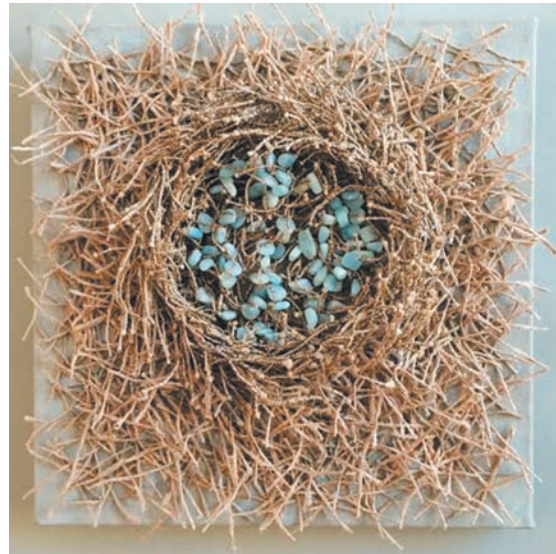
Mair McClellan, Song for Source