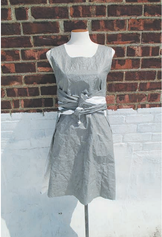
Marian Schoetle, MAU reversible wrap dress.

Invitational exhibition of contemporary textiles, showcasing the wide variety of methods and media worked by artists and articulated in fashion, accessories, jewelry, home decor, weaving, and design. Original pieces by 23 designers are on display. Professional couture and wearables, as well as wall art and sculptural installations express the latitude of the contemporary fiber arts. The pret-a-porter boutique and fitting room for fashionistas is featured.